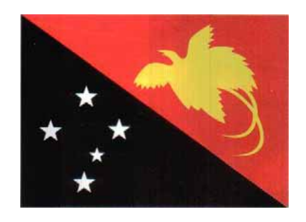
Papua New Guinea: One Nation with an inclusive development goal

The PNG National Forum for Human Capital Development will co-ordinate the process and track all outcomes.