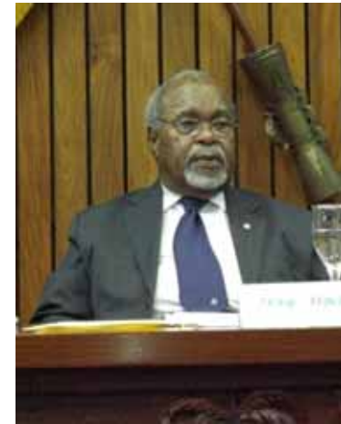
Sir Michael Somare

The majority of the world's population can only dream about access to education. For those who aspire to develop themselves without pre-qualification (from school or college) or the means of paying fees and related study costs, the barriers to entry are beyond their means.