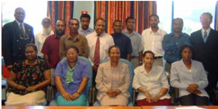
The PNG public service participates Department for Rural Development