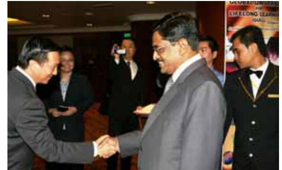
Above: The Deputy Minister of Youth & Sports (left) greets the Minister of Human Resources