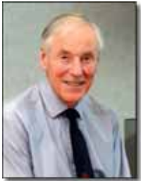
Sir Adrian Cadbury endorses GULL

Leaders: Examples: On 5 Aug 08, Sir Adrian Cadbury, a former UK University Chancellor, Chairman of Cadbury Schweppes and Director of the Bank of England (1970-1994) wrote: 'I believe that action learning is one of the most effective ways of responding to the many challenges faced by developing Nations. In providing lifelong learning opportunities for all it should be possible to secure a more inclusive and equitable role for those who have not benefited from traditional forms of education.'