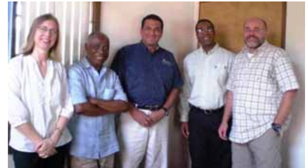
Compassion: Middle & South America Office