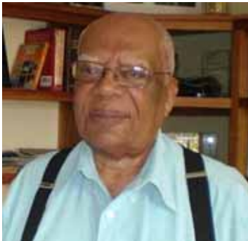
Sir Howard Cooke Former Governor General of Jamaica endorses GULL