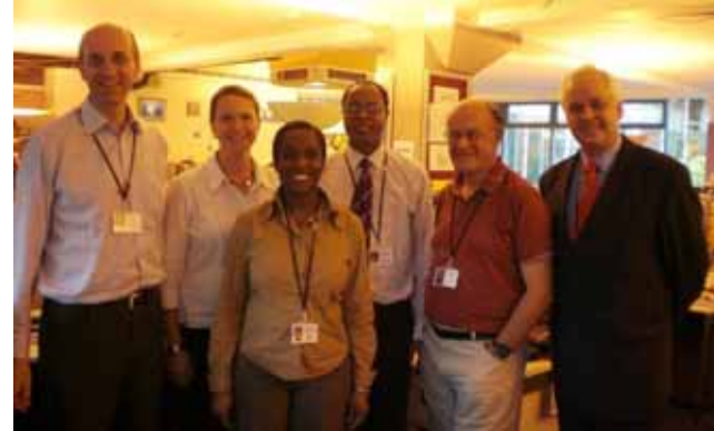
Tearfund: West Africa team, Teddington, UK

Tearfund ( www.tearfund.org.uk ) has a ten-year vision is to see 50 million people released from material and spiritual poverty through a worldwide network of 100,000 local churches.