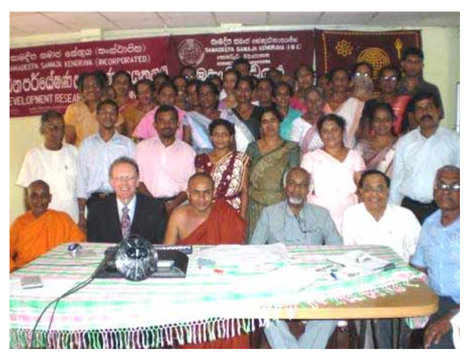
SAAGG and GULL:

Concluding the affiliation agreement, Anuradhapura, Sri Lanka on 14 Jan 2010.