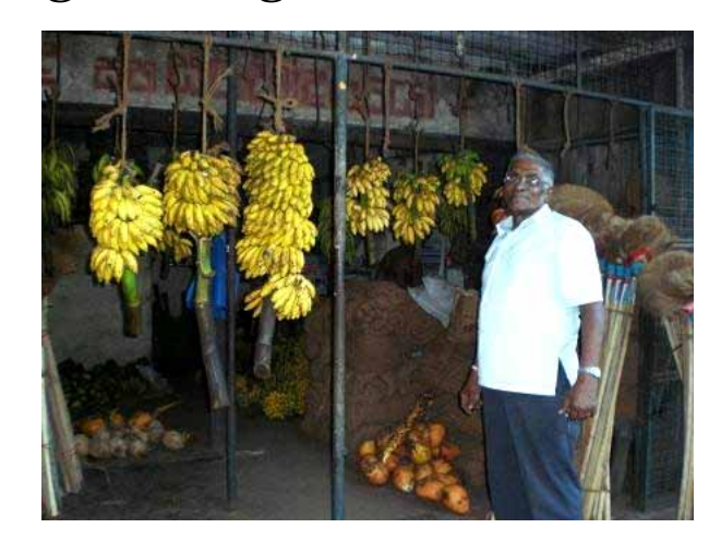
(Above) Ancient city of Anuradhapura with Chandrarathne and Sadu