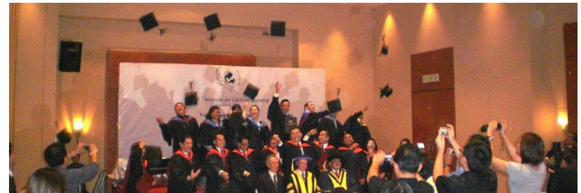
(Above) Graduates celebrate the award of GULL's professional Bachelor and Master degree qualifications.

Value's first graduation event held at the Park City Everly Hotel Bintulu on 26 March 2011 recognized the attainments of the inaugural group of managers and staff.