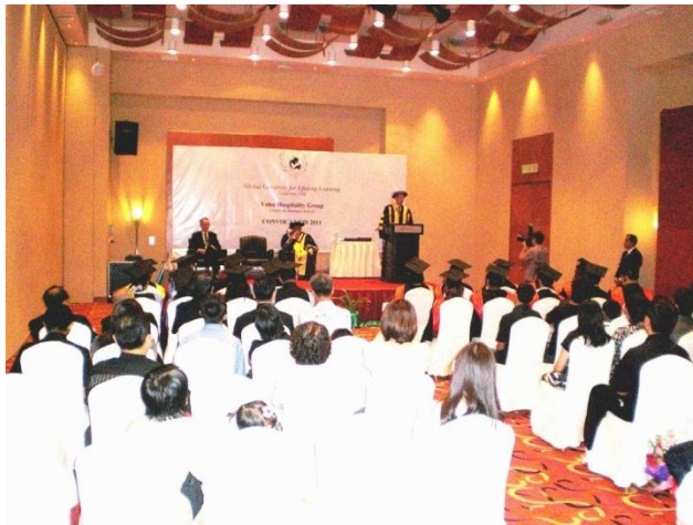
(Above) Value Hospitality CBS and GULL graduation event.

Value Hospitality currently manages 7 hotels and resorts in Malaysia and several years ago the company established the foundations of its own corporate business school (CBS) by embracing action learning and the GULL system.