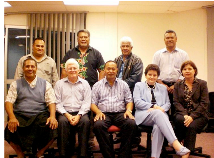
(Above) The collaborative framework

To formalize support to the Samoan community, Griffith University will adopt GULL's action learning system and stakeholder support will be secured from Woodridge State High School, Logan City Council and other agencies, together with letters of endorsement.