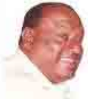
(Left) Hon. Berty Premalal Dissanayake, Chief Minister, North Central Provincial Council

Message of support from the Hon. Berty Premalal Dissanayake, Chief Minister, North Central Provincial Council: