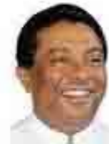
(Left) Hon. S. B. Dissanayake, Minister of Higher Education