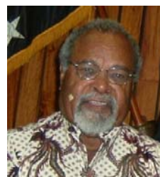
Sir Michael Somare Founding Prime Minister, Papua New Guinea