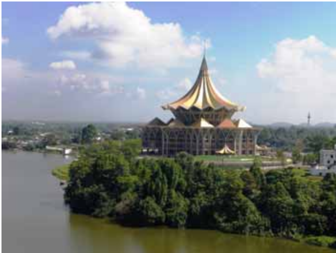
Above: Government building, Kuching, Sarawak, East Malaysia

Following GULL Asia's CBS launch in Kuala Lumpur in April, 2008, the team has expanded its work by introducing GULL to Sabah and Sarawak in East Malaysia, with State Government endorsement.