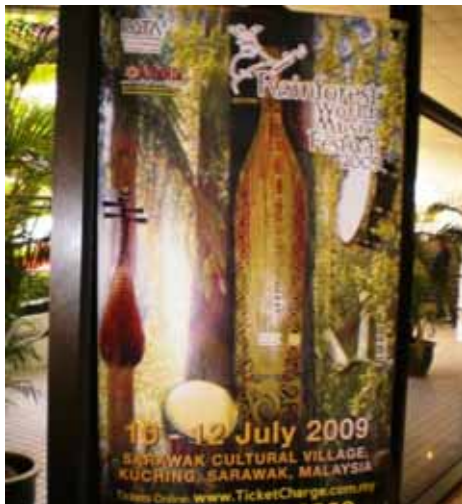
Above: Sarawak's world famous rainforest resources